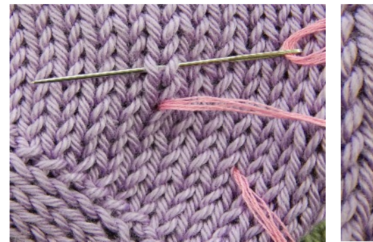
Use a waste knot, or just leave your thread resting on top of your work away from the starting point.